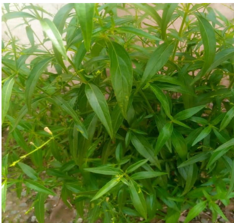
Figure 1: Image of Andrographis paniculata plant